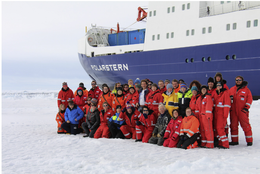
Fig. 3. Participants of the TRANSIZ expedition in front of the German research icebreaker RV Polarstern.

resources in terms of money, time, and human resources in order to participate in such exchange and communication efforts play a crucial role, not least among Arctic indigenous peoples. Often ECS are only very rarely represented in meetings where recommendations to stakeholders and decision-makers are discussed.