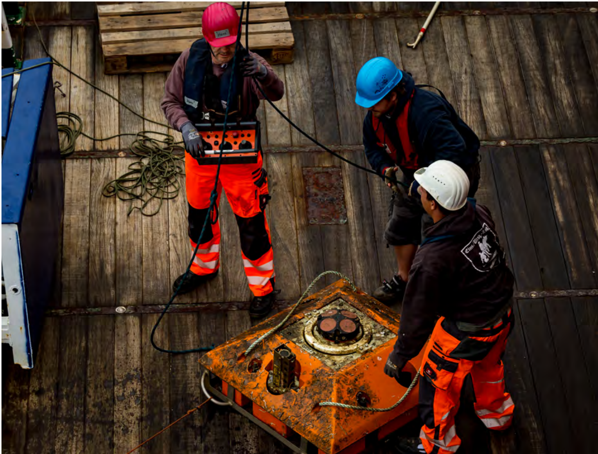
Fig. 2: Successful recovery of the IOW bottom shield equipped with an ADCP on the shelf off Namibia at 18°S (photo: SvN).

The following program of M131 includes hydrographic cross-shelf sections off Namibia at 18°S, 20°S and 23°S. Besides CTD and microstructure measurements as well as sediment grab and dredge sampling, we serviced several moorings on these sections. Up to now, we were able to successfully recover the IOW bottom shields at the shelf at 18°S and 20°S (Fig. 2). The mooring work of our cruise will be accomplished shortly before reaching Walvis Bay, the final destination of METEOR cruise M131. The moorings on the shelf off Namibia are, amongst others, equipped with acoustic Doppler current profilers. These instruments measure time series of the full-depth velocity, thereby allowing to follow signals in the along-shore flow that might propagate along the southwest African coast from the equator as far south as Walvis Bay. Associated changes in water mass properties, like temperature, nutrients and/or oxygen directly affect the biological productivity in the eastern boundary upwelling region.