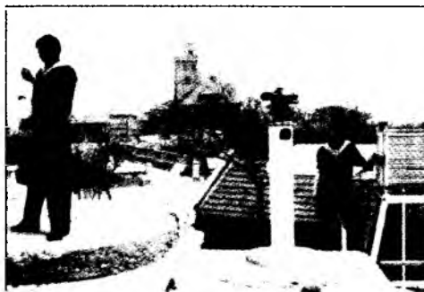
Fig. 7. Meteorological Observations at the Qingdao observatory by China's Navy

Graudenz and Schindler (1982, p. 307) summarized German scientific activities in Tsingtau after the occupation and, quite correctly, related them to the existence of the local naval observatory. As a first task, the area taken under control had to be surveyed in detail and in accordance with modern standards. Large-scale reliable charts of the bay and the port area were produced, and topographic plans and maps were prepared for the urban and surrounding areas. This cartographic inventory was essential for developing Tsingtau into a 'Musterkolonie' (model or example colony). The meteorological