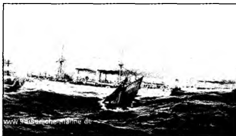
Fig. 1. Cruiser Princess Wilhelm

When the Germans occupied Qingdao on Sunday, 14 November 1897 – with a surprise invasion by a detachment of German marines (30 officers and 687 men from the cruisers Kaiser , Princess Wilhelm [Fig. 1] and Cormoran ) there were only a few buildings grouped around a Chinese fort at the entrance to Kiautschou Bay [today Jiao-zhou , see Plate I, color section]. At that time, Tsingtau was the name of a mere fishing village. Not a shot was fired and, according to reports of several of the officers involved, everything went smoothly as planned, at least for the Germans. The local Chinese commander had to give up and evacuate Tsingtau with his small force three hours after an ultimatum was delivered by Vice-Admiral von Diederichs. At 2:30 p.m. that day the German flag was hoisted in a ceremony proclaiming the occupation, with a reference