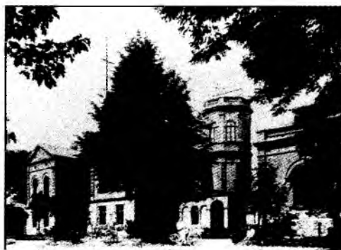
Fig. 6. Head Office of German Naval Observatory in Wilhelmshaven (1874)

These offices were responsible for charting the oceans, developing navigational instruments, and providing tidal information and meteorological data. In Germany there were two institutions involved, one military