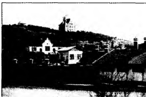
Fig. 2. German Naval Observatory on Government Hill in Tsingtau/Qingdao (1897-1914)

made to the murder of three German missionaries in Shantung on 1 November of that year. There were orders from the Kaiser in Berlin to take the area as bail against future compensation. This was, however, only a pretext, if one considers the historical events leading up to the occupation.