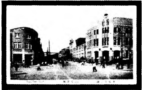
Fig. 3.&4. Scenes on old postcards, contemporary to the occupation period.