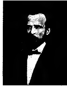
Fig. 5. Ferdinand Freiherr (baron) von Richthofen, 1833–1905

After 1875 Richthofen held a chair in geography at Bonn University and became a professor in Berlin in 1886. In 1899, he organized the Seventh International Congress of Geographers in the German capital, which is noteworthy in our context, given that a number of sessions addressed marine and polar questions. Richthofen certainly