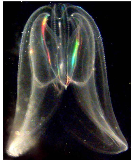
Figure 2. Mnemiopsis leidy from the Black Sea