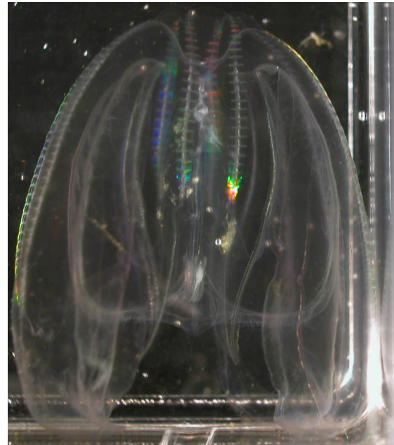
Figure 1. Mnemiopsis leidy from the Baltic Sea

The main factors to control the M. leidy population size are temperature and prey availability (Kremer 1982, 1994, Sullivan 2001). The southwestern Baltic is considered as a high productive area during winter and a high abundance of copepods has been investigated in winter months compared to the summer mesozooplankton community (Schneider 1987). It is therefore assumed that the M. leidy population in the Baltic Sea developed high